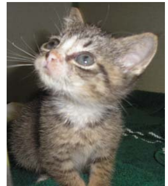
Tripod is one of the many animals helped by the Franky Fund.

Unfortunately, BARCS alone does not have the funding for expensive, specialized treatment of these homeless pets. Without donations to support their life-saving care, sadly many of these animals are humanely euthanized so that they don't suffer—dogs and cats that would otherwise be wonderful pets. The Franky Fund will provide the medical treatment necessary to treat these unfortunate homeless animals. With your help, we can give innocent pets another chance at life. It's a critical situation in need of immediate attention. Please help us help them—today!